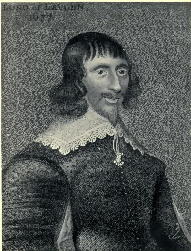
JOHN CAMPBELL First Earl of Loudoun